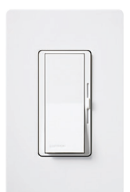
Hardwired Dimmer DVLV-600P-WT

Recommendations for the best lighting and power locations